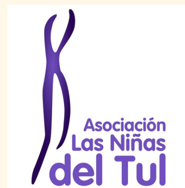
Asociación Las Niñas del Tul (Spain)