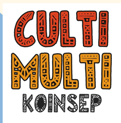
Culti Multi (Greece)